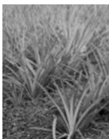
Hope Centre's pineapple patch